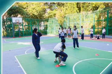
Students try doing the sport.