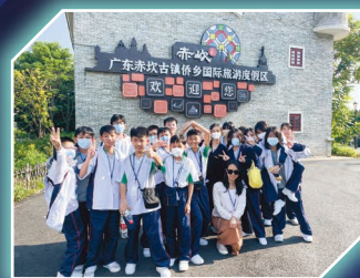
Students take a group photo with their class teacher.

Our college organized a visit to Kaiping, a historic city in China for our S.1 students. The visit aimed at enabling our students to gain a better understanding of the unique architectural landmarks of our motherland. The visit expanded the horizons of our students, enriching their knowledge of China's rich and cultural heritage and strengthening their national identity.