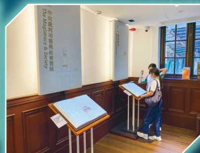
Students discover the heritage significance of Tai Kwun.