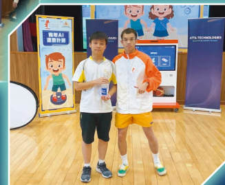
Our student receives an award after performing well in the AR Sports Trial.