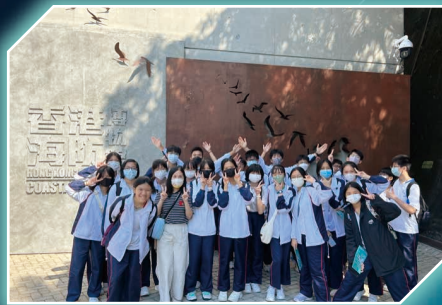
Students and the class teacher take a group photo at the entrance of the Hong Kong Museum of Coastal Defence.