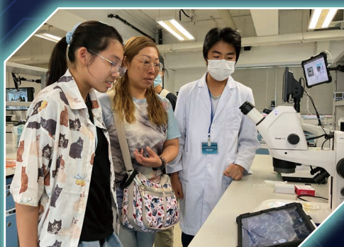
Our student helper introduces the equipment to visitors in the Tony Tong Bio-Technology Lab.