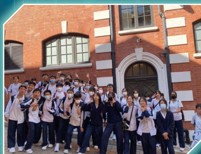
Students take a group photo after learning more about the history of Tai Kwun.