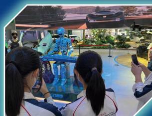
Students witness the development of AI technology during the visit.