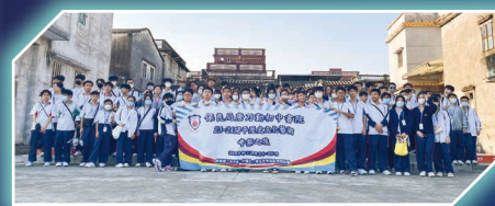
Students take a group photo at a historical village of Kaiping.