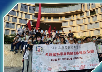
Students have a group photo at the Hong Kong University of Science and Technology (Guangzhou).

Beside the study tours in our country, students also visited different places in Hong Kong, which deepened their understanding of the city's history of Hong Kong, the history of Po Leung Kuk, language learning, heritage conservation and the knowledge of sports. Here were some highlights: