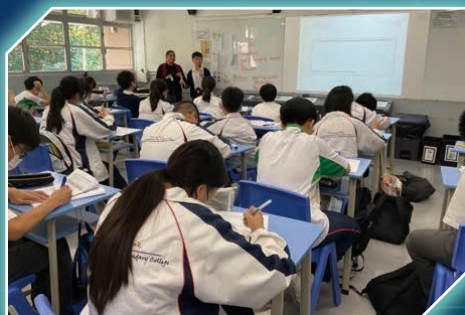
Students engage in the English public speaking training.