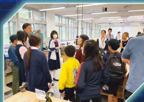
Our student helpers introduce how lessons are conducted in the Smart Home Lab.