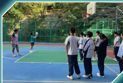
Students are listening to the instructor about how they can throw and catch the rugby properly.