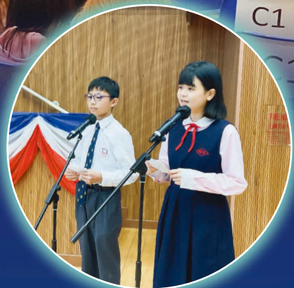
Our student Masters of Ceremonies give visitors a warm welcome.

Overall, the response to the Information Day was very positive in general. The school remains committed to nurturing our students with love and care.