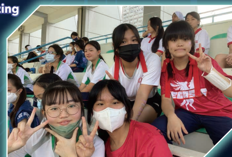
Students share joy and laughter together!