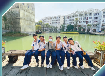
Students enjoy spending their time while learning more about the history of Kaiping in Chikan Town.