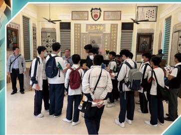
Students listen to the tour guide.