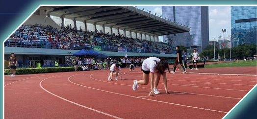
Students are ready for the race competition.