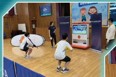
The AR sport machine teaches students the correct posture of exercising.