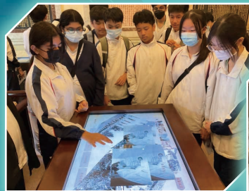
Students learn the history of Po Leung Kuk.