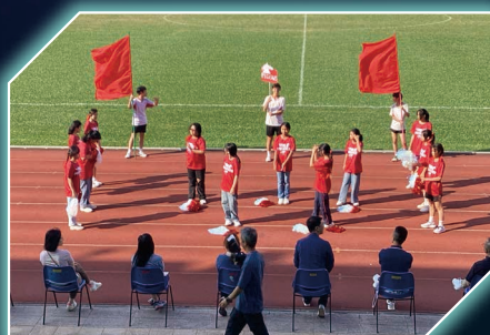
Members of House Pegasus Team perform on the sports ground.