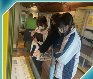
Students jot down important notes while visiting the galleries in the museum.