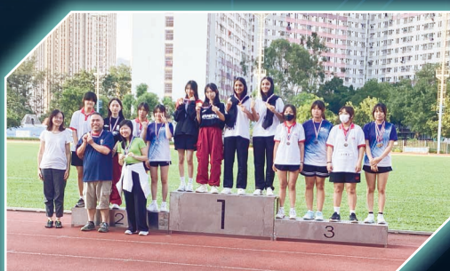
Congratulations to the winners!