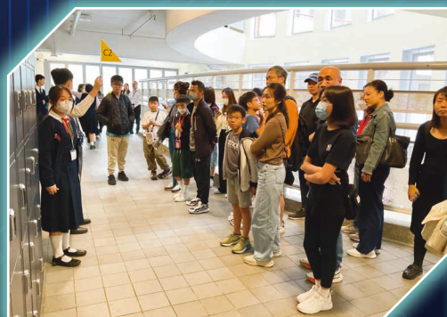
Teachers and student helpers arrange a school campus tour for all visitors.