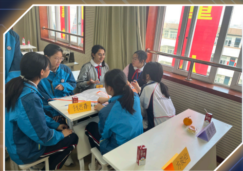
Students from both schools make a kite together.

Overall, our students thoroughly enjoyed this experience, as it helped them connect with their classmates and gain a deeper understanding of the Chinese culture. They eagerly anticipate future opportunities for similar trips.