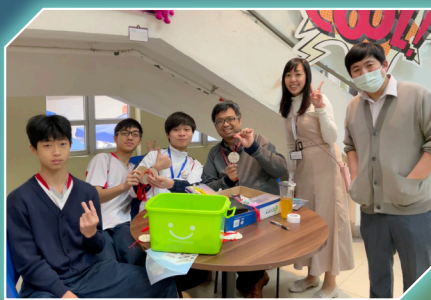
Students write down their goals and make up a plan for achieving them.