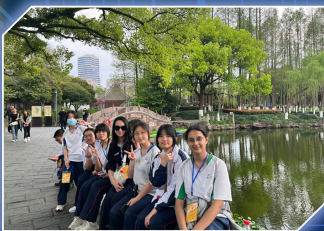
Our students take a group photo in the park.