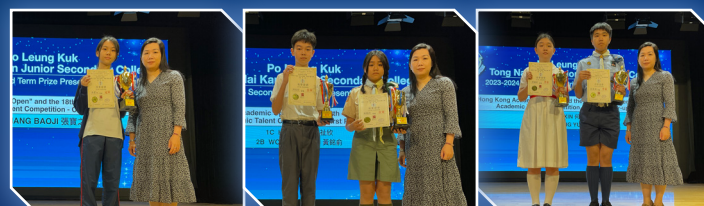
Our students obtained excellent results in "Hong Kong Academic Open" and "The BNCL Certificate" Academic Talent Competition. They were: