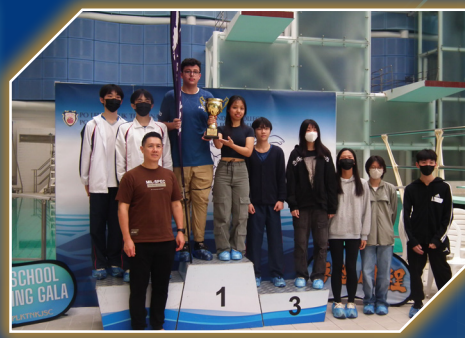
Congratulations to the winning houses!