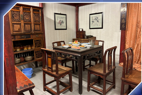
Here is a display of a traditional Chinese homeroom in the Museum of Ningbo.