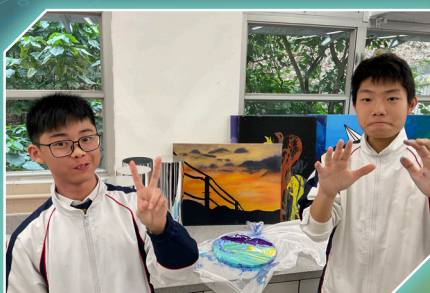
Students learn how to create a fluid paint artwork.