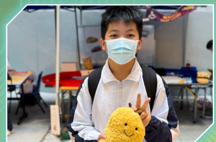
Our student wins a prize from a game booth.