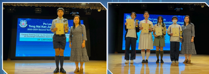
Our students obtained excellent results in "Campus Drawing Cup" for the 22nd Hong Kong Youth Recitation · Literature Art · Exchange Competition Award (Solo Verse Speaking). They were: