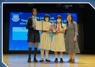
Our students obtained the Silver Award in "The 4th Hong Kong Chinese Orchestra Competition". They were: