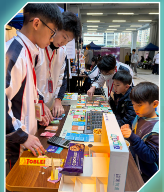
Students demonstrating how to play board games

The event featured different STEAM competitions, displays of artworks, game booths, workshops, hands-on activities and