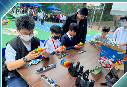
Students try solving a Rubik's Cube in the competition.