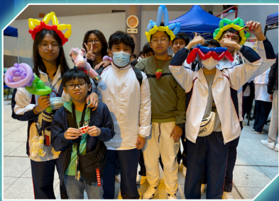
Students taking a group photo

Overall, it was a memorable experience for all students who enjoyed the richness of learning activities in TNK. The school will continue to provide resources and support for students.