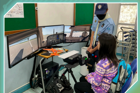
Our school offers a full flight simulator that provides visitors with the ultimate simulation experience.