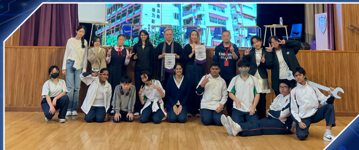
Our students won the Award for Outstanding Performers and Award for Outstanding Stage Effects from Hong Kong School Drama Festival 2023/2024.