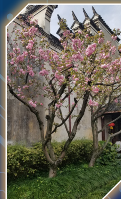
Spring flowers are everywhere in Ningbo.