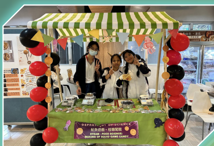
Students get ready for a sweet adventure in the Squid Game Dalgona Candy booth!