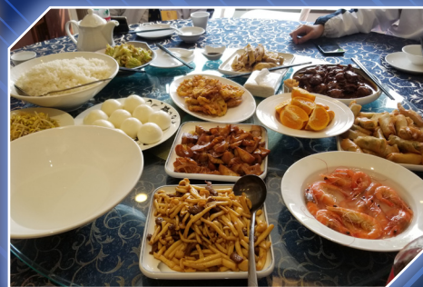
Students enjoy traditional Ningbo cuisine.