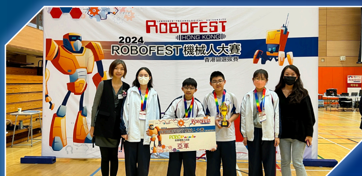
The students from the Robotics Team won the 1st Runner-up in the Robofest Competition (Hong Kong Region) 2024 (Robo Parade).