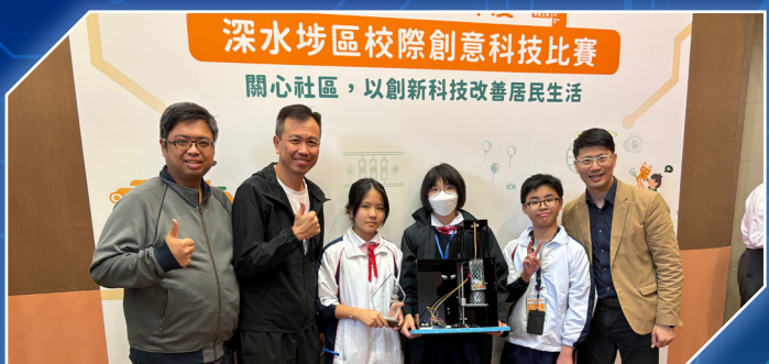
The students from the robotics team won Creative Applied Technology Award in participated the 2023-2024 SSP District Inter-school Creative Technology Competition. They were: