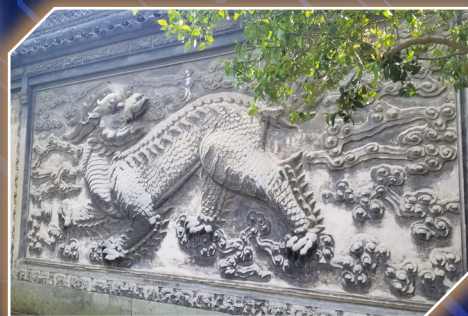
Students view a beautiful Chinese dragon wall sculpture.