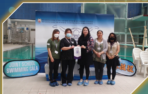
Parent helpers receive a Certificate of Appreciation. Thank you parents for your hard work!