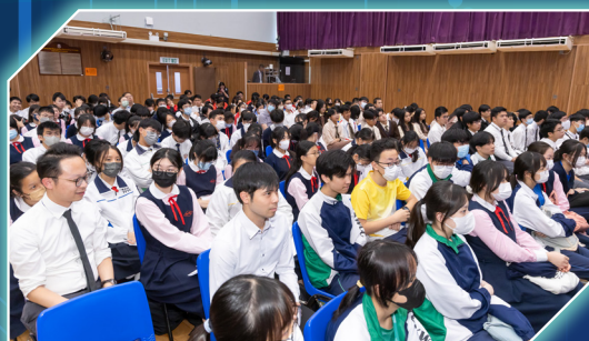
Over 300 affiliated students at Po Leung Kuk attend the talk.