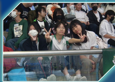
Students and teachers cheer on the athletes.